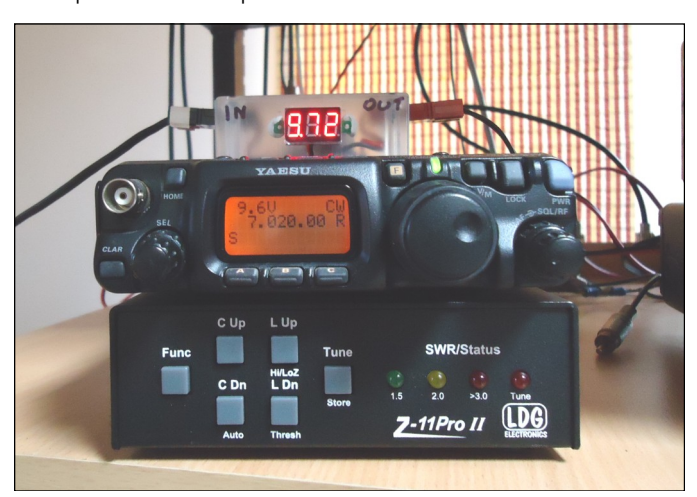
The completed kit with the FT817 and LDG tuner.