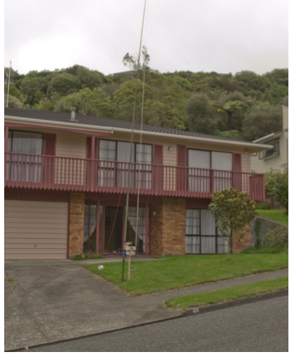
10m permanent mast with G5RV behind the house and 10m temporary mast at the letterbox using 'full legal' QRP power.