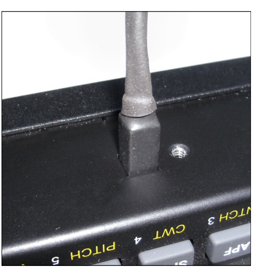
The plug allows two keys to be used with the KX3.