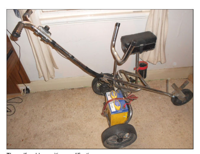
The golf caddy awaiting modifications.

Entries close on 20 November 2014. Prizes will be available.