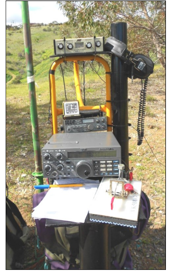
RF Trolley Mark I.