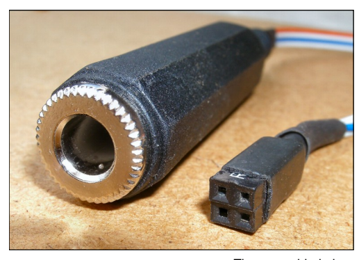
The assembled plug.