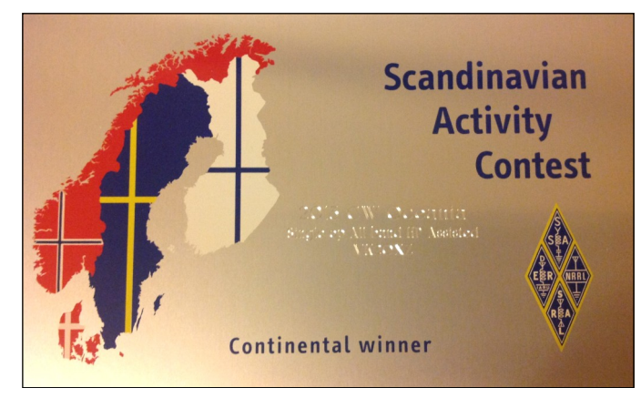
Scandinavian Activity Contest award plaque.

The special thing with OXZ was the callsign they used when they where listening for traffic, for example: cq cq cq de oxz81 oxz81 oxz81 qsx 16 mhz ii ii - those two ii ii were very easy to identify if there was QRM on the frequency, or if the signal was weak. Remember it was only in the last few years that we've had receivers with digital displays!