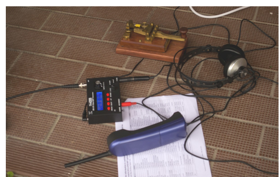
QRP station based on a YouKits HB-1B.

I have a YouKits HB-1B 5W QRP rig. If you hear from me, please be patient. 5 watts CW seems to be a challenge.