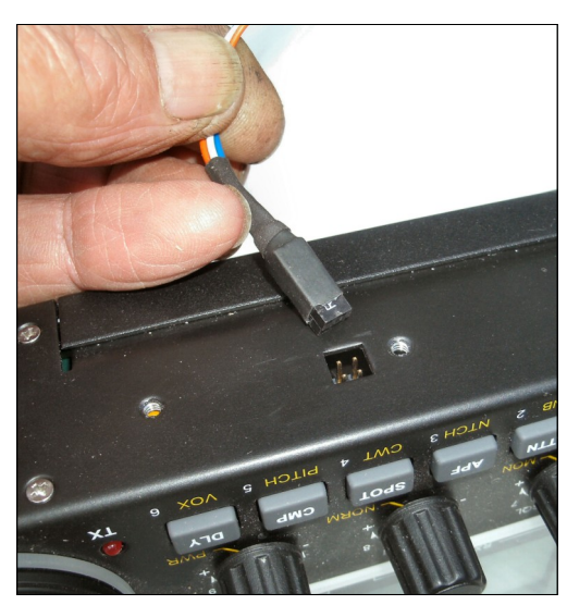
Plug and KX3 paddle socket.