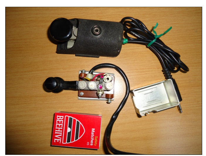
USSR key alongside a matchbox and Jardillier key.

You can see in the picture that it is smaller than a matchbox and even made my small Jardillier key look large. However the cable was just too stiff and short. I would place the key in the correct position and the cable would move the key into a new unwanted position. So off it came and I put on a much thinner and more flexible cable. It had another problem and that was the bottom of the key knob would bottom out on the desk before the two points had made contact. I raised the bed of the key a bit by sticking it down with two sided foam mounting adhesive tape, but it still needed some more room. So I cut out a circle in the plywood to allow the contacts to mate properly. Voila!