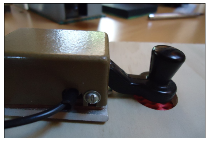
Side view of USSR key.

with my thumb and next three fingers. My thumb and the third finger rest on the skirt of the key.