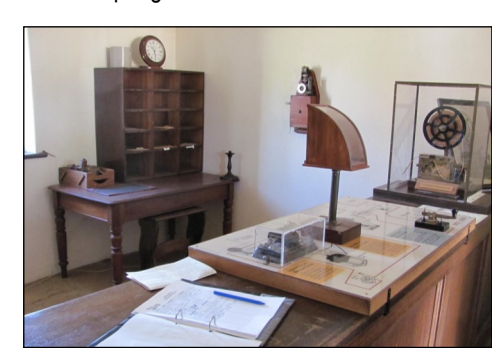
Inside the Telegraph Office at Alice Springs

Between Sunday 21 June and Saturday 27 June 2015, free telegrams were sent between Adelaide and Alice Springs by members of the Morsecodian Fraternity SA / NT. A temporary telegraph station was established at the Holdfast Bay Discovery Centre in Glenelg to make contact with the Old Telegraph Station in Alice Springs.