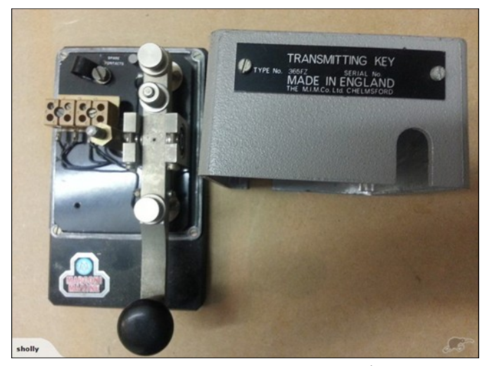
The Marconi key which recently sold on TradeMe for NZD$400.

Last month on TradeMe, a beautiful Marconi Marine key in pristine condition went for auction. It sold for $400. There have been some nice looking keys built in USSR on the same site. This reminds me that I have often had ragchews with stations whose straight keys I suspect have dirty contacts. I have mentioned this before, but it is worth putting an Ohm-meter across the contacts and checking the resistance. Depending on the material of the points, I would start off by dragging a sliver of clean paper between the contacts and then measuring the resistance once more. I have heard of people using very fine emery paper, but I would only use that as a last resort. It is worth checking on a regular basis.