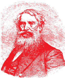
Samuel F.B. Morse 1791-1872

For news of what's happening in the world of Morse, read "MM"!