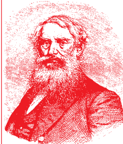
Samuel F. B. Morse 1791-1872

For news of what's happening in the world of Morse, read "MM"!