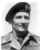
Field Marshall Sir Bernard Montgomery

In Sainte Mère-Eglise, the 82nd and the 101st Airborne were dropped in the night of the 5 to 6th of June 1944, as part of the Field Marshall Montgomery's Neptune plan.